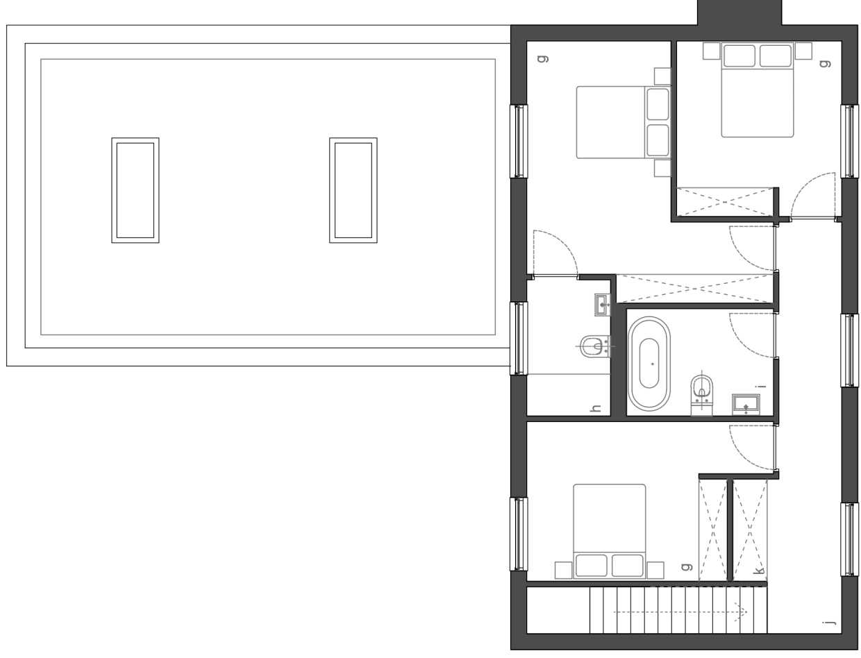
02 First Floor Plan